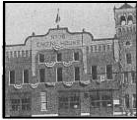
Central Ohio Fire Museum and Learning Center